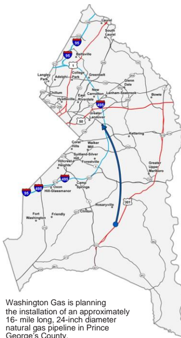
Washington Gas is planning the installation of an approximately 16-mile long, 24-inch diameter natural gas pipeline in Prince George's County.

Washington Gas is constructing new infrastructure for Prince George's County and the entire region. Built mostly in public and electric utility corridors, the project paves the way for economic growth and serving more residents with clean, affordable natural gas service. The investment will include approximately 16 miles of coated steel, natural gas pipeline and regulating stations connecting two portions of Washington Gas' existing system.